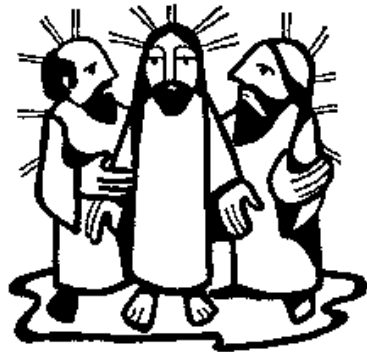
Jesus, Moses, and Elijah on the mountain.