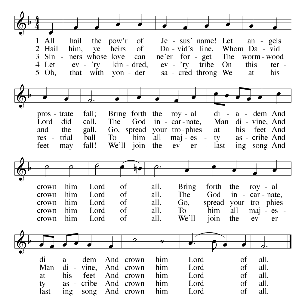
OPENING HYMN , CW #370, "ALL HAIL THE POWER OF JESUS' NAME"

Text: Edward Perronet, 1726–92, st. 1-3, abr., alt.; A Selection of Hymns, London, 1787, st. 4-5, alt. Tune: CORONATION (86 86 86) Oliver Holden, 1765–1844.